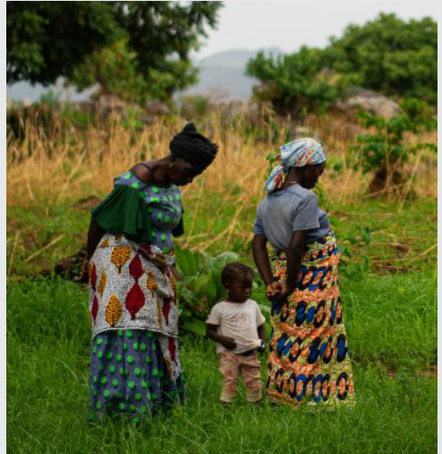
▲ A bereaved mother-in-law and daughter-in-law from Zikke village bow their heads in prayer. The father and son to whom they were married were both killed in the attack in April. The younger widow is pregnant