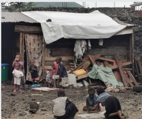
▲ TBF Trust is funding food distribution amongst Christians displaced by violence in the north-east, living in conditions like this

Please pray for an end to all violence in DRC. At the time of writing, there are peace talks trying to settle the ethnic and political issues and end the