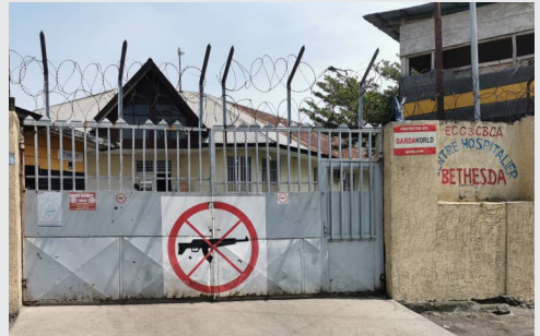
A medical fund provided by TBF Trust will pay for treatment in this hospital for some of the neediest Christians displaced by violence

of the major perpetrators is a group currently called Islamic State Central Africa Province (ISCAP). They make plain in their publicity that they are killing the local people because they are Christians. ISCAP are also battling against the Congolese military.